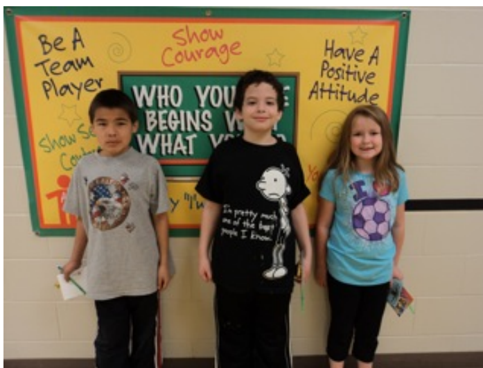
Second Grade April Birthdays